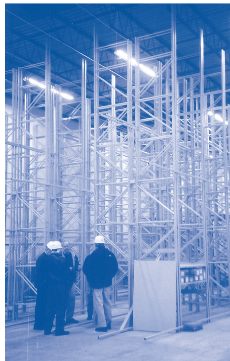
A view of a large storage bay in the Annex during construction

Detailed information about the new Library Collections Annex is available on the Brown Library website at: www.brown.edu/Facilities/University_Library/lib/annex/index.html